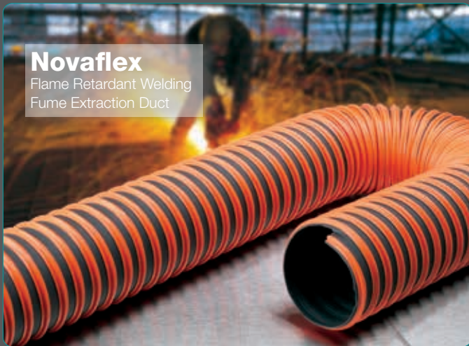
Novaflex Flame Retardant Welding Fume Extraction Duct

The Novaflex Group ® is a market leader through excellence in product innovation and design. The Novaflex Group ® is a privately held company committed to the continuous advancement in hose and connector solutions. Novaflex has one of the broadest product ranges available in the hose and ducting marketplace, as well as HVAC and Industrial Venting, Hose Industries and Commercial Exhaust Venting Systems. Products are sold in industries across North America and around the world.