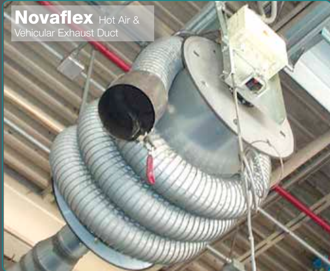
Novaflex Hot Air & Vehicular Exhaust Duct